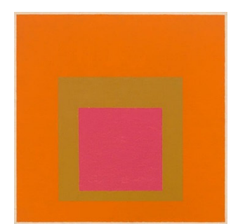
Josef Albers Young Prediction (Homage to the Square), 1954 Öl auf Masonit Private collection