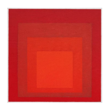
Josef Albers Homage to the Square, 1969 Öl auf Masonit Josef Albers Museum Quadrat Bottrop