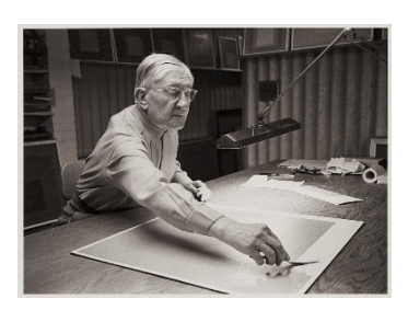
John T. Hill ohne Titel (Josef Albers), o. J. Fotografie

John T. Hill ohne Titel (Josef Albers), o. J. Fotografie