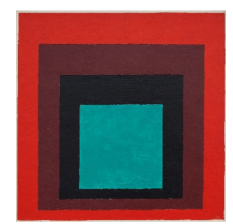
Josef Albers Homage to the Square: Tempered Ardor, 1950 Öl auf Masonit Josef Albers Museum Quadrat Bottrop