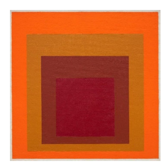
Josef Albers Study to Homage to the Square: Old Gate, 1954-56 Öl auf Masonit Josef Albers Museum Quadrat Bottrop