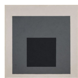
Josef Albers Homage to the Square »A«, 1950 Öl auf Masonit The Cartin Collection