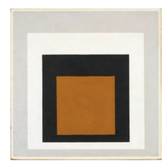
Josef Albers Homage to the Square: New Gate, 1951 Öl auf Masonit The Josef and Anni Albers Foundation